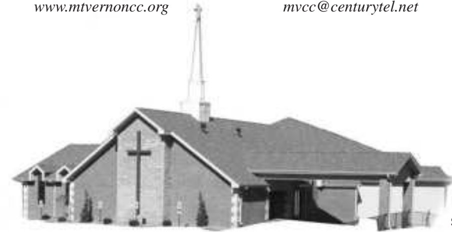
Issue # 45 October 2007